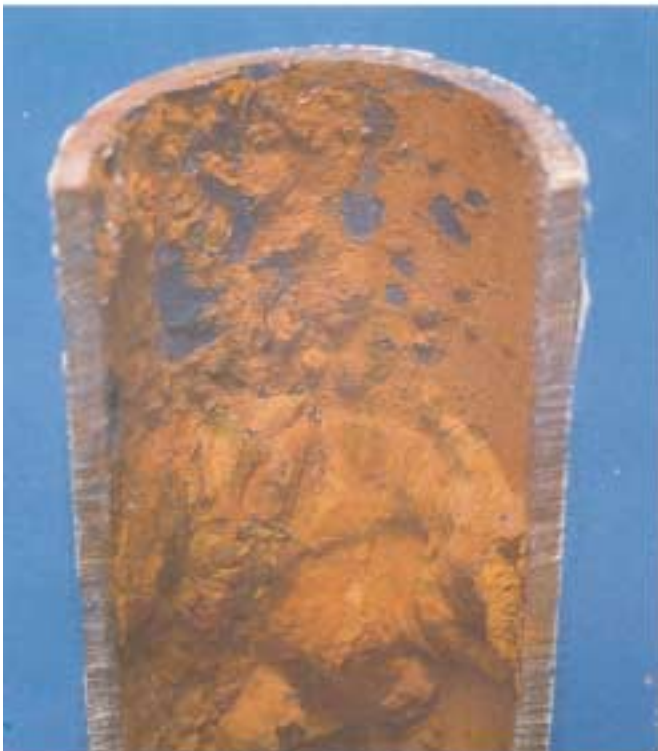
Galvanized pipe heavily corroded