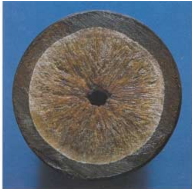
Galvanized pipe heavily scaled