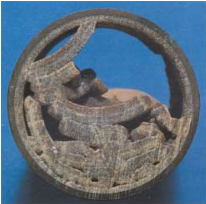
Copper pipe with scale plug

Hard waters form scale in pipes and boilers. This leads to decrease in water pressure and an increased energy demand. Clogged pipes may have to be replaced. Heating coils may overheat and fail.