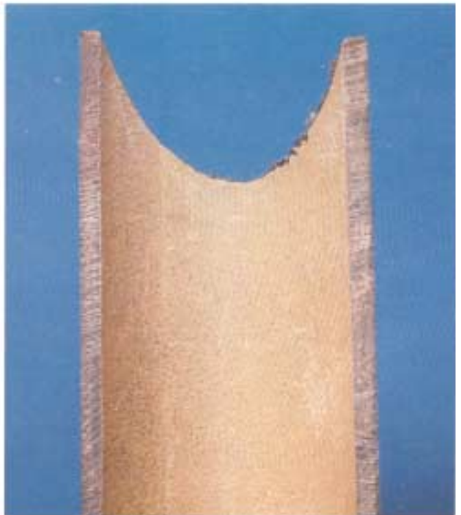
SILIPHOS ® protective layer